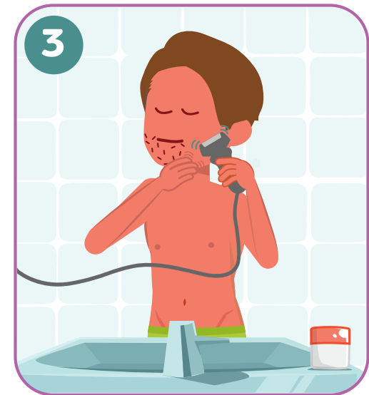
3 Gently glide razor over face