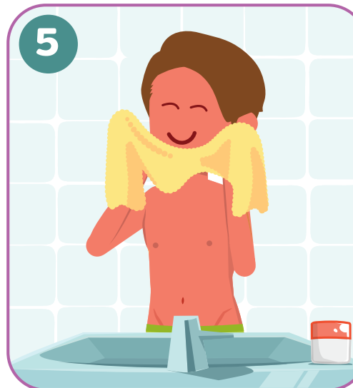
5 Pat face dry with a towel