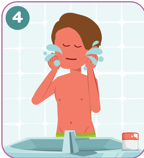
4 Wash face with water