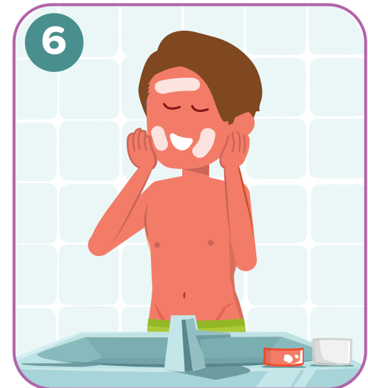
6 Put on moisturiser