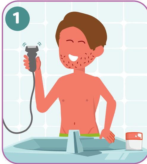
1 Turn on electric razor